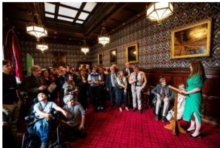
13 May Jubilee Room, Parliamentary Reception to celebrate 150 Years of Alexandra Palace